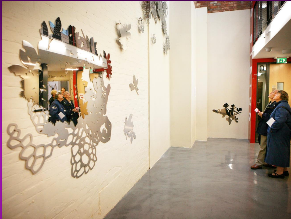
The Old Fire Station, Oxford