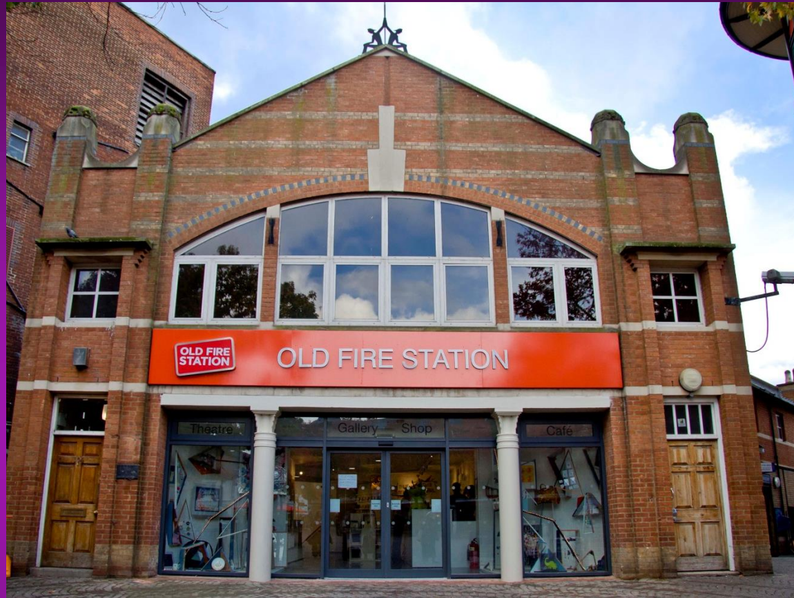
The Old Fire Station, Oxford