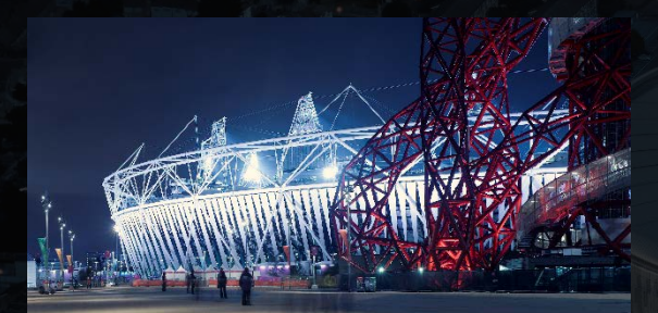
London 2012 Games and Legacy Delivery