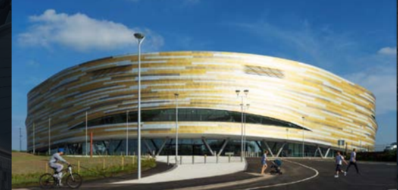
Derby Multi-Use Arena