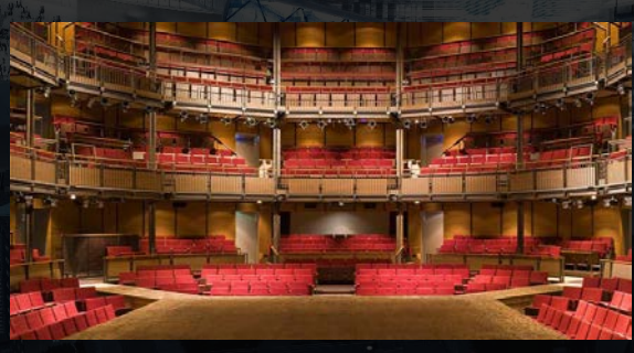
Royal Shakespeare Theatre