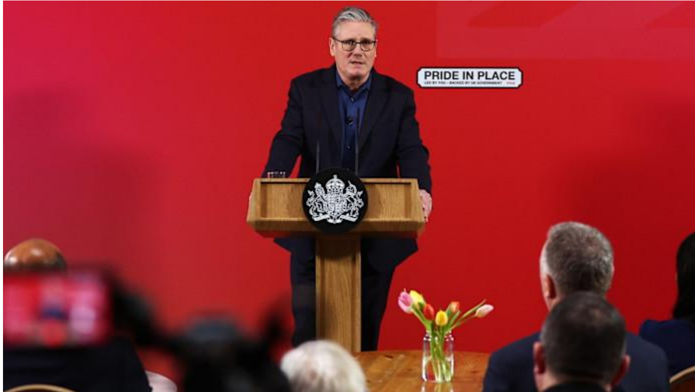
The PM endorsing the Pride in Place Programme